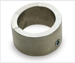
Cam Item No. 10881 for cross rose bits, single flute