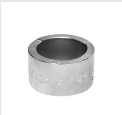
Cam Item No. 12487 for 3 edged countersinks, inclination 0,8 mm Item No. 12488 for 3 edged countersinks, inclination 1,2 mm