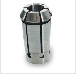
Collet set Item No. 14348 for SVR 20 (Ø 6, 8, 12 mm)