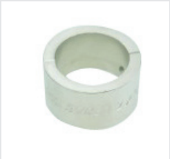
Cam Item No. 10606 for two flute countersinks