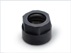
Item No. 10880 Nut for extra collets